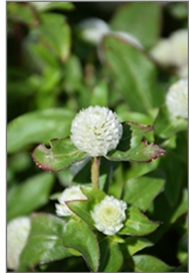
Gnome White Gomphrena flowers

This plant will require occasional maintenance and upkeep. Trim off the flower heads after they fade and die to encourage more blooms late into the season. It is a good choice for attracting bees and butterflies to your yard. It has no significant negative characteristics.