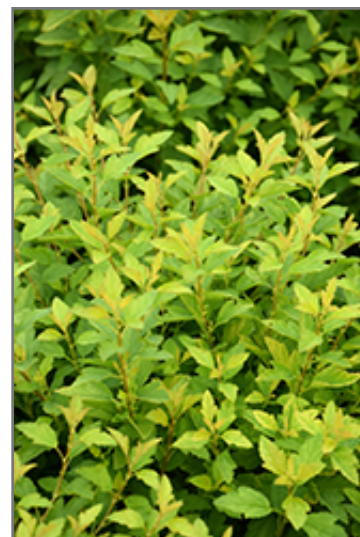
Raspberry Lemonade Ninebark foliage

Raspberry Lemonade Ninebark is recommended for the following landscape applications;