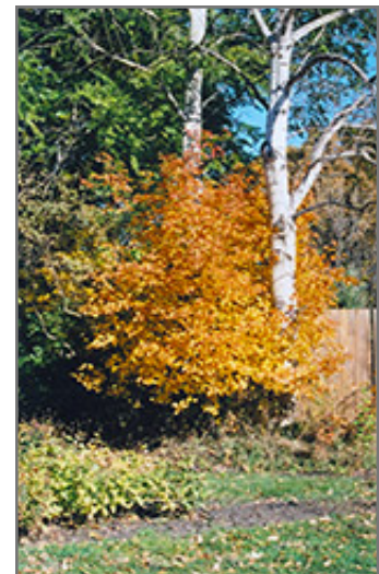
Saskatoon in fall