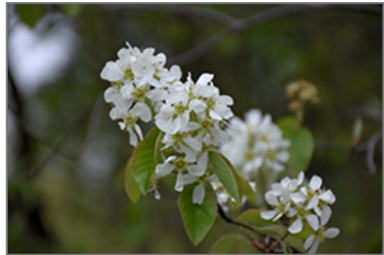
Saskatoon flowers

Saskatoon is a multi-stemmed deciduous shrub with an upright spreading habit of growth. Its relatively fine texture sets it apart from other landscape plants with less refined foliage.