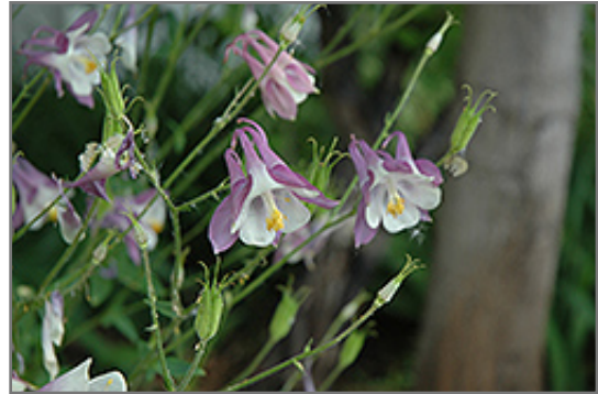
Common Columbine flowers

This is a relatively low maintenance plant, and should be cut back in late fall in preparation for winter. Deer don't particularly care for this plant and will usually leave it alone in favor of tastier treats. Gardeners should be aware of the following characteristic(s) that may warrant special consideration;