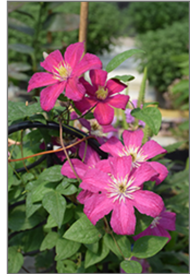
Barbara Harrington Clematis flowers