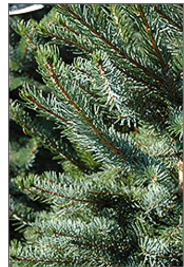
Brun's Spruce foliage