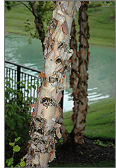
River Birch bark