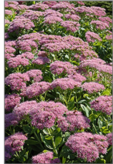
Brilliant Stonecrop flowers

Brilliant Stonecrop is recommended for the following landscape applications;