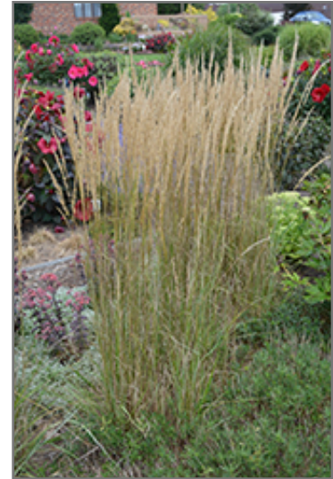
El Dorado Feather Reed Grass

El Dorado Feather Reed Grass is recommended for the following landscape applications;