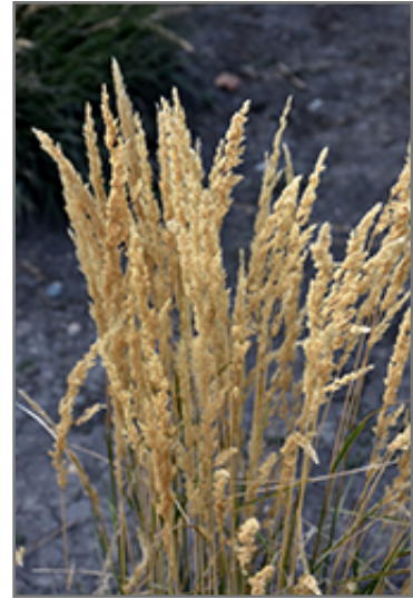
El Dorado Feather Reed Grass fruit

El Dorado Feather Reed Grass is a fine choice for the garden, but it is also a good selection for planting in outdoor pots and containers. Because of its height, it is often used as a 'thriller' in the 'spiller-thriller-filler' container combination; plant it near the center of the pot, surrounded by smaller plants and those that spill over the edges. It is even sizeable enough that it can be grown alone in a suitable container. Note that when growing plants in outdoor containers and baskets, they may require more frequent waterings than they would in the yard or garden.