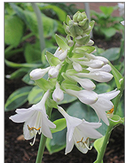
King Tut Hosta flowers