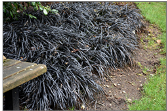
Black Mondo Grass

Black Mondo Grass is recommended for the following landscape applications;