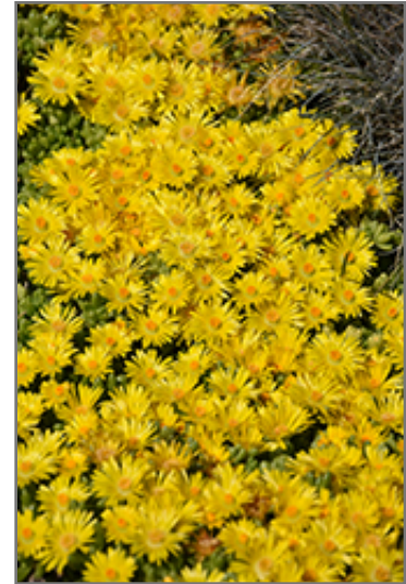
Yellow Ice Plant flowers

Yellow Ice Plant is recommended for the following landscape applications;