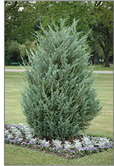
Moonglow Juniper