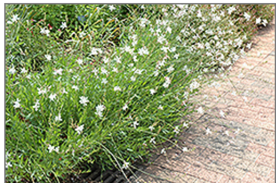
Whirling Butterflies Gaura in bloom