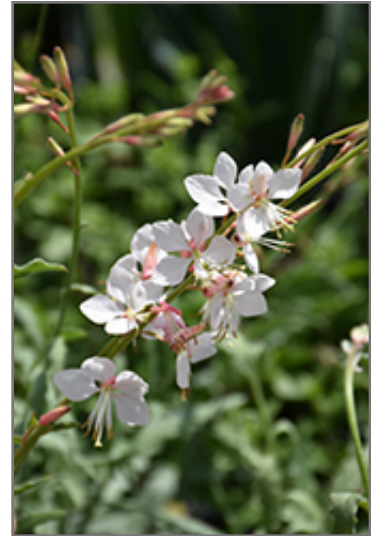
Whirling Butterflies Gaura flowers

Whirling Butterflies Gaura is an open herbaceous perennial with tall flower stalks held atop a low mound of foliage. It brings an extremely fine and delicate texture to the garden composition and should be used to full effect.