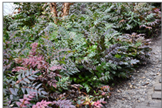
Oregon Grape Holly