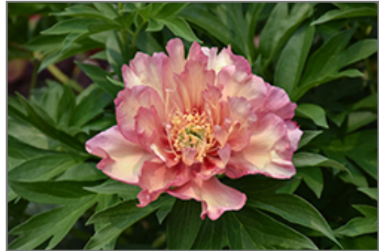
Julia Rose Peony flowers