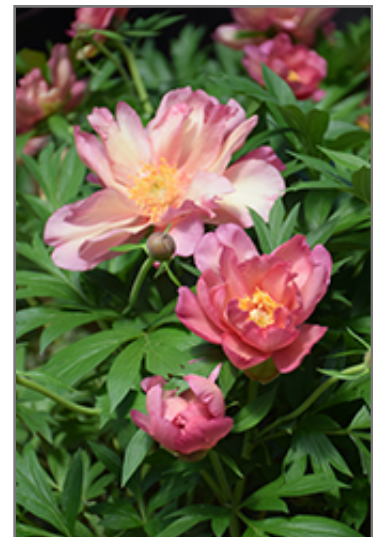
Julia Rose Peony flowers