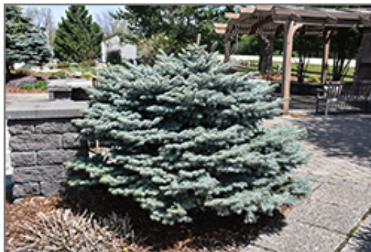
Globe Blue Spruce