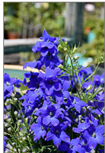
Diamonds Blue Delphinium flowers