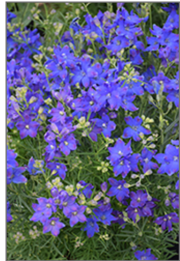
Diamonds Blue Delphinium flowers