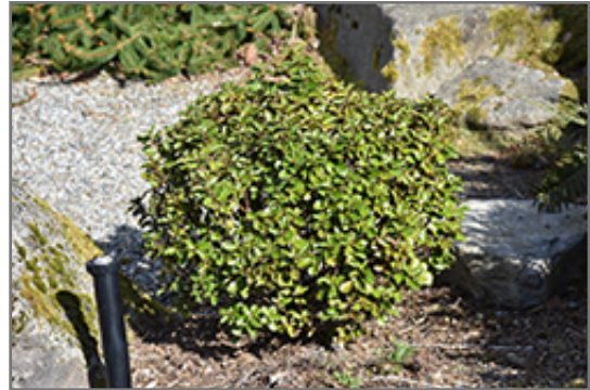
Little Rascal Meserve Holly

Little Rascal Meserve Holly is recommended for the following landscape applications;