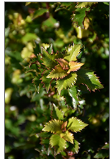
Little Rascal Meserve Holly foliage