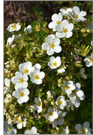
McKay's White Potentilla flowers