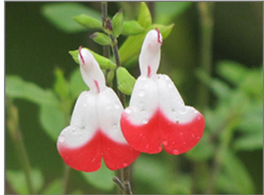
Hot Lips Sage flowers

Hot Lips Sage is an herbaceous evergreen perennial with an upright spreading habit of growth. Its relatively fine texture sets it apart from other garden plants with less refined foliage.