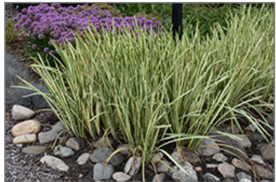
Variegated Sweet Flag