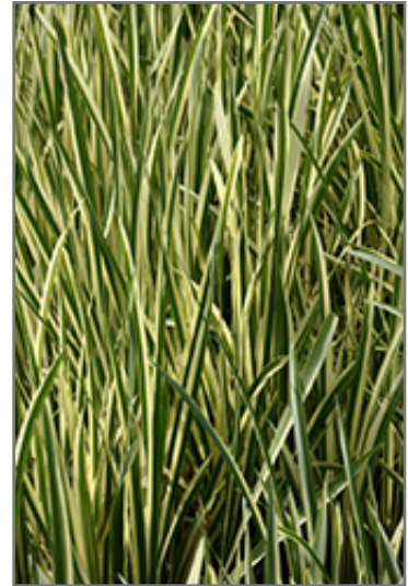
Variegated Sweet Flag foliage

Variegated Sweet Flag is a fine choice for the garden, but it is also a good selection for planting in outdoor pots and containers. It is often used as a 'filler' in the 'spiller-thriller-filler' container combination, providing a canvas of foliage against which the larger thriller plants stand out. Note that when growing plants in outdoor containers and baskets, they may require more frequent waterings than they would in the yard or garden.