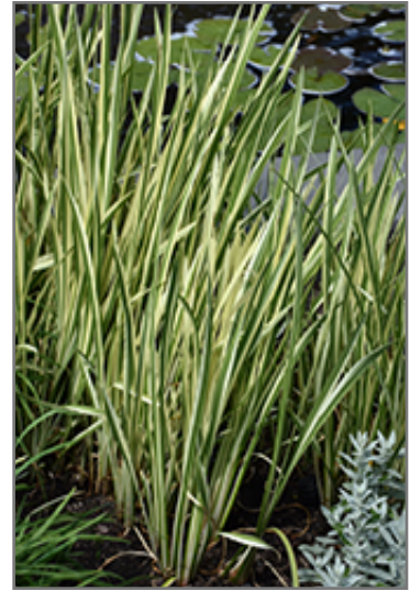
Variegated Sweet Flag

Variegated Sweet Flag is recommended for the following landscape applications;