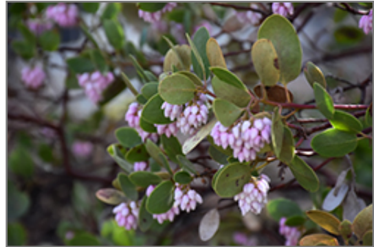
Common Manzanita flowers

This shrub does best in full sun to partial shade. It is very adaptable to both dry and moist growing conditions, but will not tolerate any standing water. It is very fussy about its soil conditions and must have sandy, acidic soils to ensure success, and is subject to chlorosis (yellowing) of the foliage in alkaline soils, and is able to handle environmental salt. It is somewhat tolerant of urban pollution. This species is native to parts of North America.