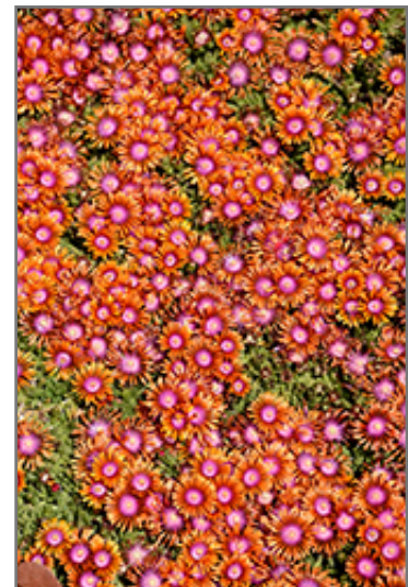
Fire Spinner Ice Plant flowers