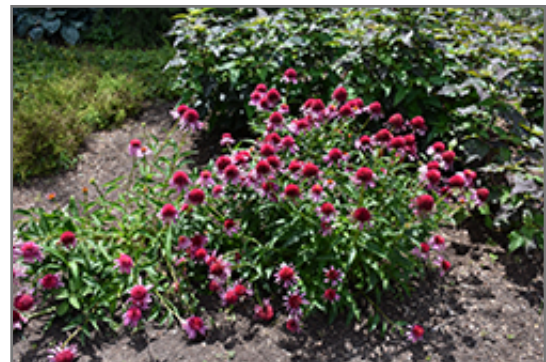
Double Scoop Bubble Gum Coneflower in bloom