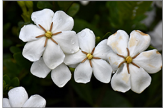
Kleim's Hardy Gardenia flowers