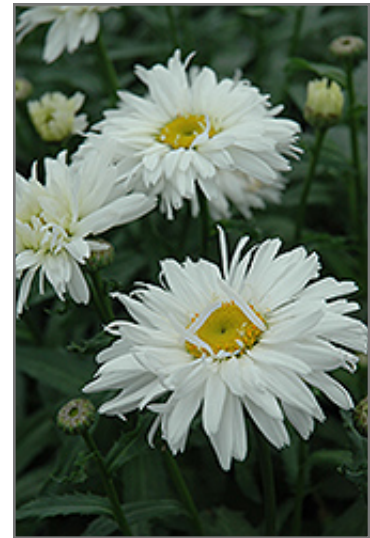
Razzle Dazzle Shasta Daisy flowers