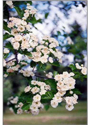
Snowbird Hawthorn flowers