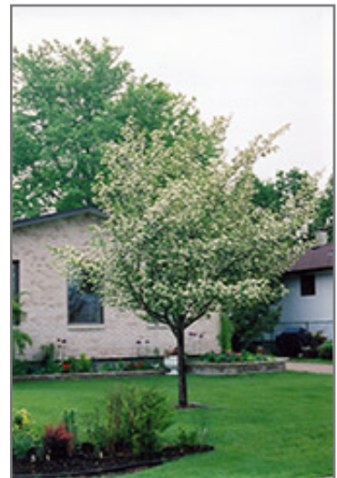
Snowbird Hawthorn in bloom