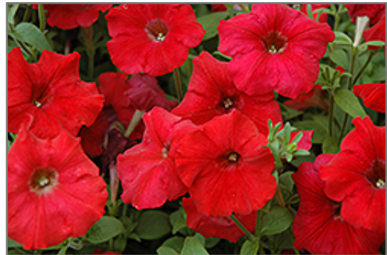
Easy Wave Red Petunia flowers

Easy Wave Red Petunia is a dense herbaceous annual with a trailing habit of growth, eventually spilling over the edges of hanging baskets and containers. Its medium texture blends into the garden, but can always be balanced by a couple of finer or coarser plants for an effective composition.