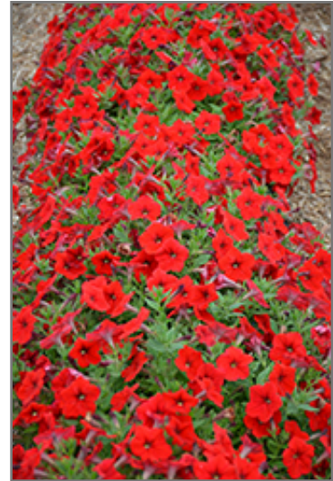
Easy Wave Red Petunia in bloom

Easy Wave Red Petunia is a fine choice for the garden, but it is also a good selection for planting in outdoor containers and hanging baskets. Because of its trailing habit of growth, it is ideally suited for use as a 'spiller' in the 'spiller-thriller-filler' container combination; plant it near the edges where it can spill gracefully over the pot. Note that when growing plants in outdoor containers and baskets, they may require more frequent waterings than they would in the yard or garden.