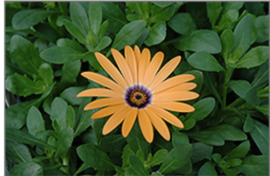
Orange Symphony African Daisy flowers