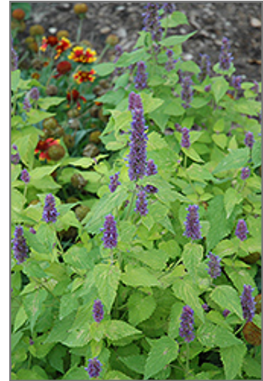
Golden Jubilee Anise Hyssop flowers

Golden Jubilee Anise Hyssop is a dense herbaceous perennial with an upright spreading habit of growth. Its medium texture blends into the garden, but can always be balanced by a couple of finer or coarser plants for an effective composition.