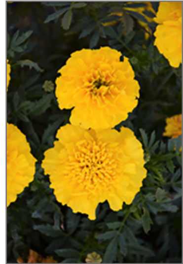
Bonanza Yellow Marigold flowers

Bonanza Yellow Marigold will grow to be about 12 inches tall at maturity, with a spread of 8 inches. When grown in masses or used as a bedding plant, individual plants should be spaced approximately 6 inches apart. Its foliage tends to remain dense right to the ground, not requiring facer plants in front. This fast-growing annual will normally live for one full growing season, needing replacement the following year.