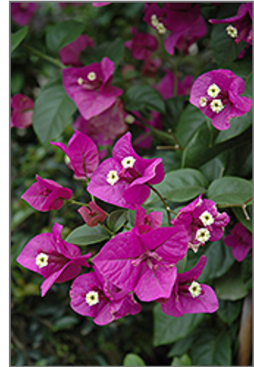
Purple Queen Bougainvillea flowers