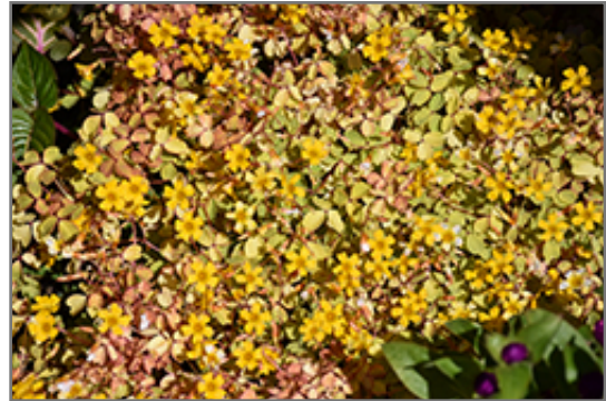
Molten Lava Shamrock in bloom