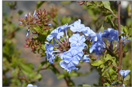
Imperial Blue Plumbago flowers

Imperial Blue Plumbago is recommended for the following landscape applications;