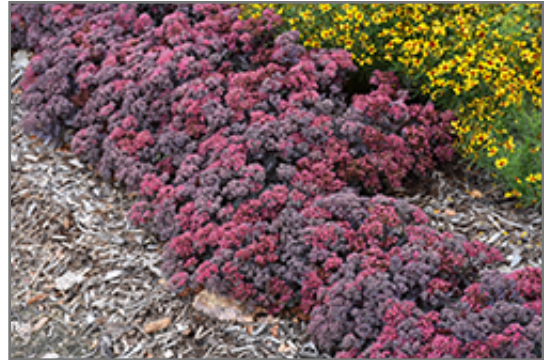
Dazzleberry Stonecrop in bloom

Dazzleberry Stonecrop is a fine choice for the garden, but it is also a good selection for planting in outdoor pots and containers. It is often used as a 'filler' in the 'spiller-thriller-filler' container combination, providing a mass of flowers and foliage against which the larger thriller plants stand out. Note that when growing plants in outdoor containers and baskets, they may require more frequent waterings than they would in the yard or garden.