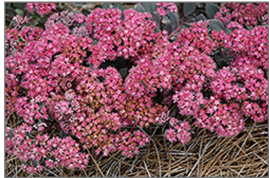
Dazzleberry Stonecrop flowers

Dazzleberry Stonecrop is a dense herbaceous perennial with an upright spreading habit of growth. Its medium texture blends into the garden, but can always be balanced by a couple of finer or coarser plants for an effective composition.