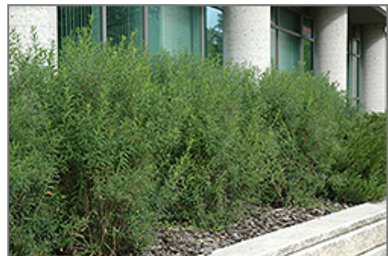
Dwarf Turkestan Burning Bush