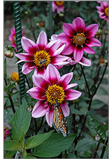
Blue Bayou Dahlia flowers