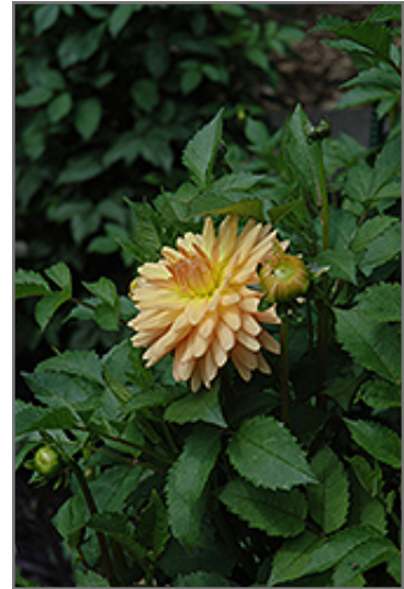
Embrace Dahlia flowers