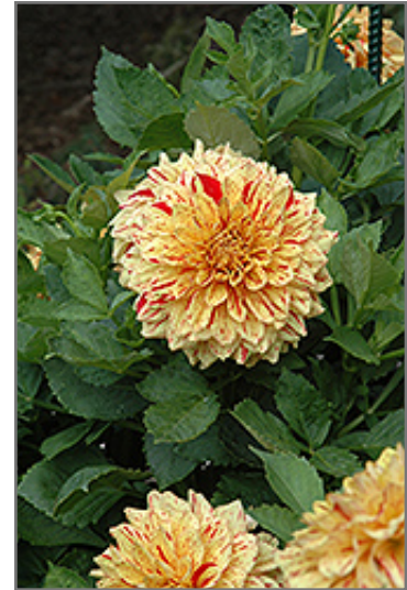
Gloriosa Dahlia flowers