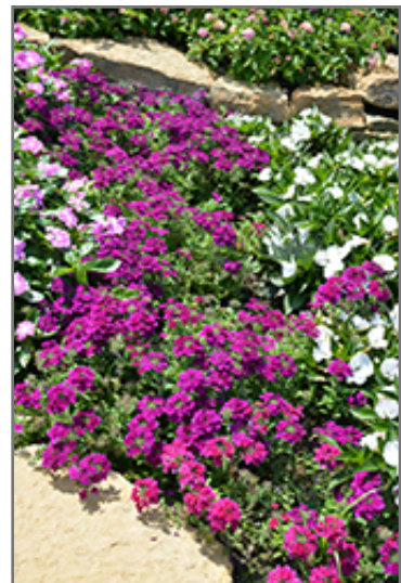
Superbena Royale Plum Wine Verbena in bloom