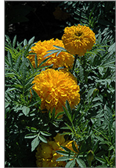
Bali Gold Marigold flowers

Bali Gold Marigold will grow to be about 24 inches tall at maturity, with a spread of 24 inches. When grown in masses or used as a bedding plant, individual plants should be spaced approximately 20 inches apart. Its foliage tends to remain dense right to the ground, not requiring facer plants in front. This fast-growing annual will normally live for one full growing season, needing replacement the following year.