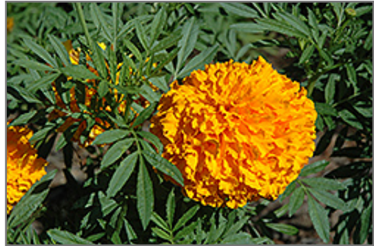
Bali Orange Marigold flowers