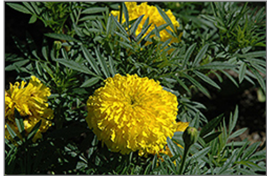
Bali Yellow Marigold flowers