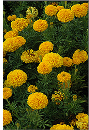
Lady Gold Marigold flowers