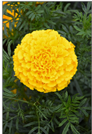
Lady Gold Marigold flowers