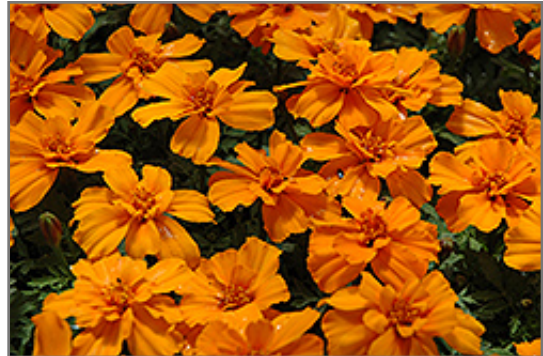
Safari Tangerine Marigold flowers