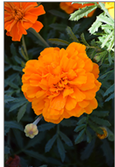
Safari Tangerine Marigold flowers