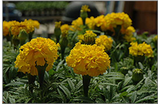
Safari Yellow Marigold flowers