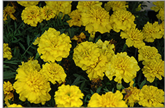
Boy Yellow Marigold flowers