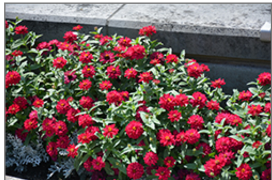
Profusion Double Hot Cherry Zinnia in bloom