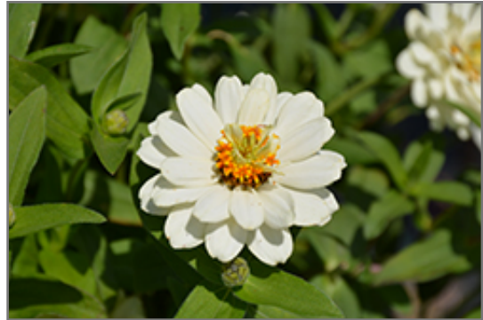
Profusion Double White Zinnia flowers

* This is a 'special order' plant - contact store for details