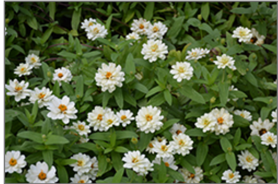
Profusion Double White Zinnia flowers